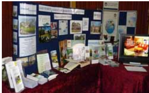
Our joint stand at 'Bible by the Beach', Eastbourne.